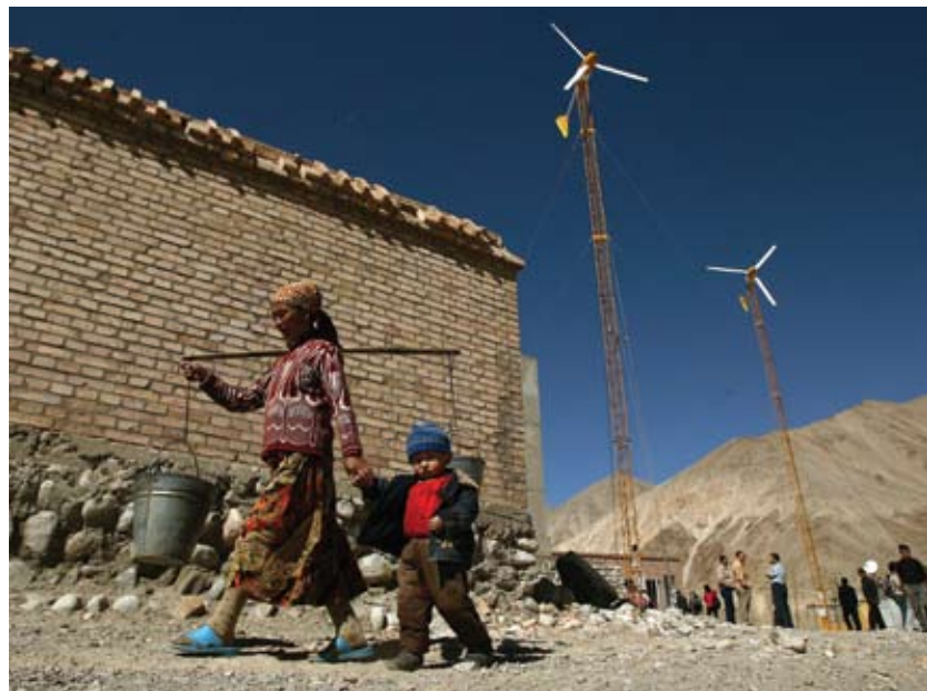
Stephen Shaver/Bloomberg News (China)

The detailed climate risk assessment leads to the identification of adaptation options (fourth item on our generic list) and prioritization and selection of adaptation options (fifth item). At the national and sectoral level, this corresponds to the inclusion of adaptation-specific programmes and projects as well as the inclusion of cross-sectoral and sectoral top-down adaptation activities.